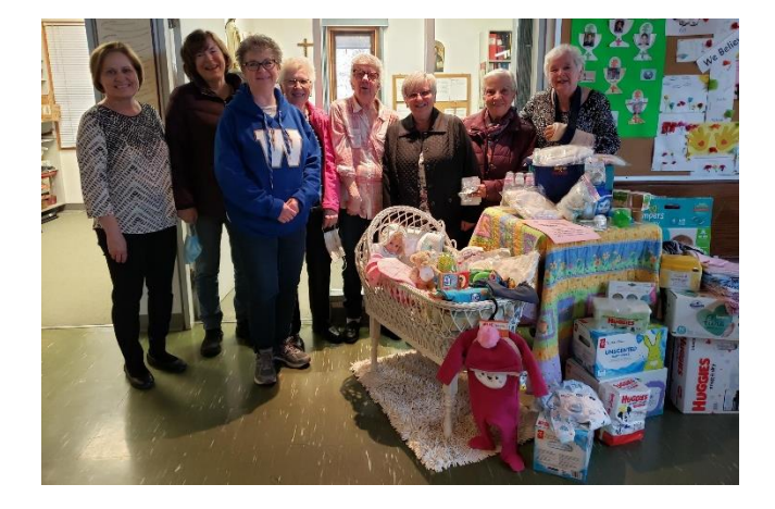
Members of the Ladies Auxiliary with the donated baby items.

On behalf of the Ladies Auxiliary we want to extend our heartfelt "Thank You" to all the wonderful parishioners who donated a variety of baby items for the "Young Moms" in need. Our hearts are full with your generosity and answering our call.