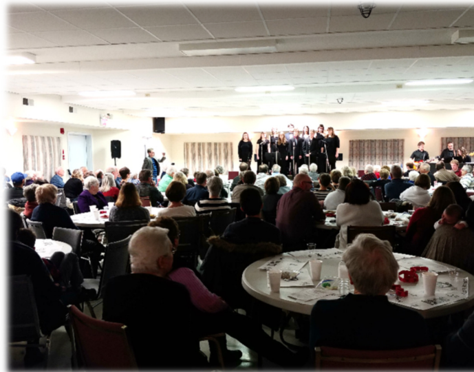
Guests enjoying performances by Enharmony